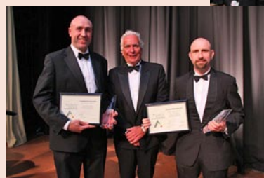
Rail Industry Awards for Excellence 2008